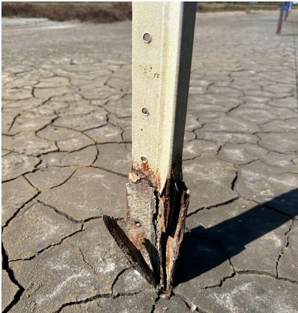
Steel maxi star pickets can rust away in less than 3 years in some areas.

EnduraPost BULLpost is the perfect solution in high pressure zones where steel star pickets either rust, are bent, or even snap off under pressure, leaving a very sharp and dangerous legacy in the ground that must be removed carefully.